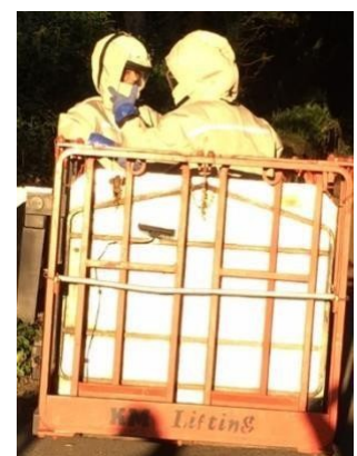
Professionals wearing protective clothing at nest 47

Hopefully we will not have the same issues with Asian hornets in the North of England anytime soon.