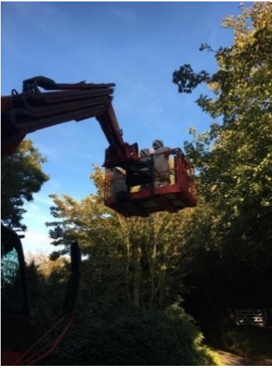
Destruction of nest 47

meet a team of volunteers in a car park near to a pub. We parked the car and joined them for an open-air briefing before everyone moved to bait stations some distance away. A few weeks after we returned to the UK, I discovered that they had found a nest (number 71 of 2019) high up in a sycamore tree directly behind where we had parked the car!