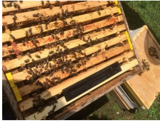
Small Hive Beetle oil trap in a hive

Locating sentinel apiaries near to places of risk is key to maximise the chance of detecting an early incursion. Ports are deemed to be a very high risk and we have some of the busiest in the country (e.g. Liverpool and those in the Tyneside area). We also have container rail links from Europe into Manchester, and numerous depots for imported food and other goods.