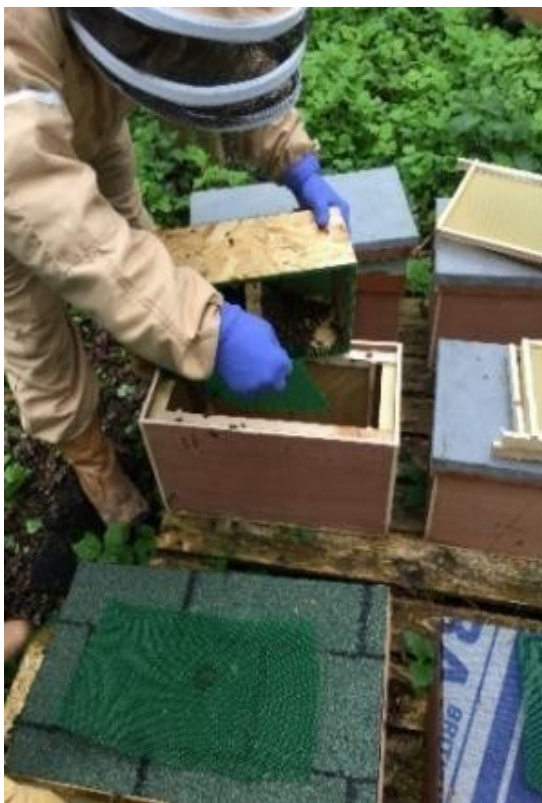
Beekeeper decanting package bees

A considerable number of import inspections were carried out in the Northern Region throughout the 2019 season. Of these many were consignments of queens but there was also a considerable number of packages containing worker bees clustering around a queen pheromone insert. The charts below outline the number of 2019 and 2018 imports into mainland Britain from the EU. It can be seen that package bee consignments from Italy have greatly increased since 2018 whilst imports of nucleus colonies has reduced. Queen imports have also risen.