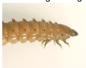
SHB larva

The running contingency exercises in England and Wales is a key performance indicator in the bee health programme. In July 2019 the NBU in liaison with Welsh Government ran a contingency exercise to respond to a simulated outbreak of SHB. A 'Forward Operating Base' (FOB) was located at the Welsh Government Offices, Llandudno Junction. An incident command system (ICS) as used by the emergency services was put in place involving set roles of incident commander, sector commander, and command support. I was fortunate enough to be assigned the sector commander role.