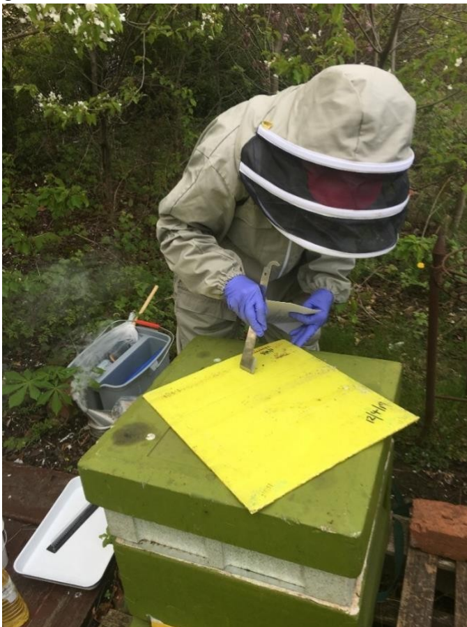
Julia collecting debris for laboratory examination

Locating sentinel apiaries near to places of risk is key to maximise the chance of detecting an early incursion. Ports are deemed to be a very high risk and we have some of the busiest in the country (e.g. Liverpool and those in the Tyneside area). We also have container rail links from Europe into Manchester, and numerous depots for imported food and other goods.