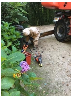
Preparing to destroy nest 47

It should be noted that handling or being close to Asian hornets, and especially the resultant destruction of the nest is very dangerous and should be left to the professionals with suitable protective equipment.