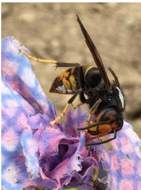
Asian hornet at the potato field bait station